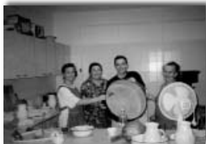
Author with head kitchen staff