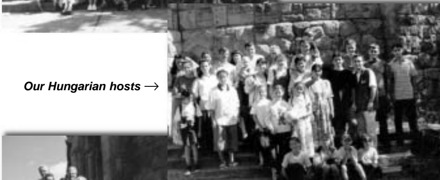
Our Hungarian hosts →