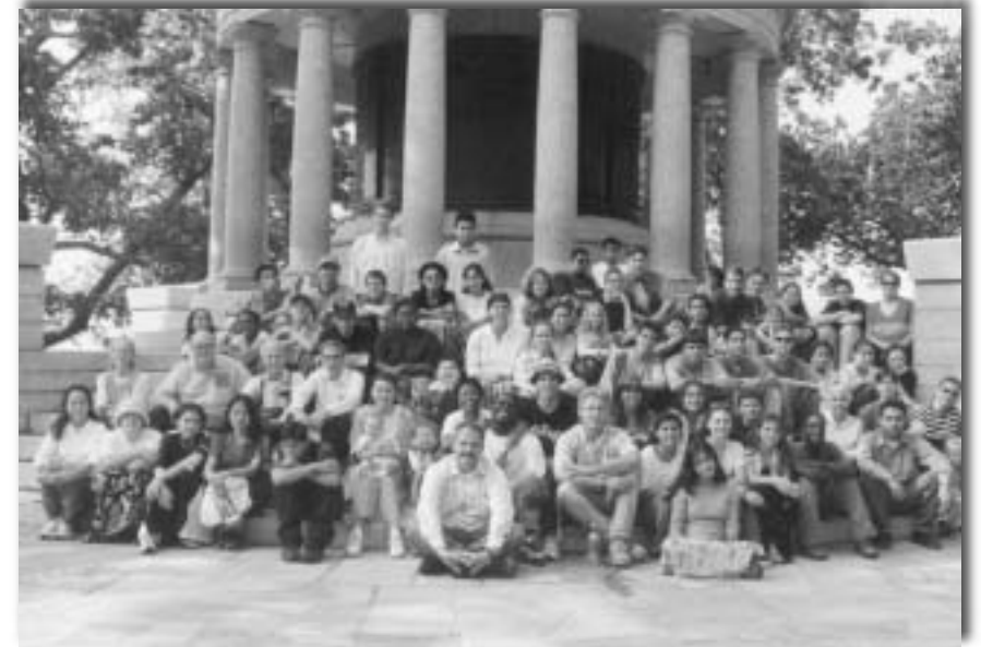
At the top of the incline railway

Now, those of you who did not attend, not only missed out on the blessings received from the meet-