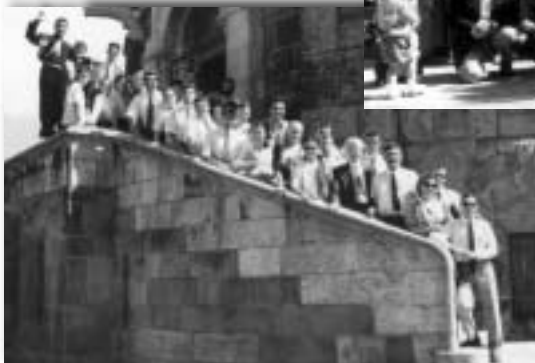
← Some of the Ukrainian attendees

principle and preference. Each of these topics was "heavy" as one brother put it. But those present took notes and will hopefully continue studying the same topics at home.