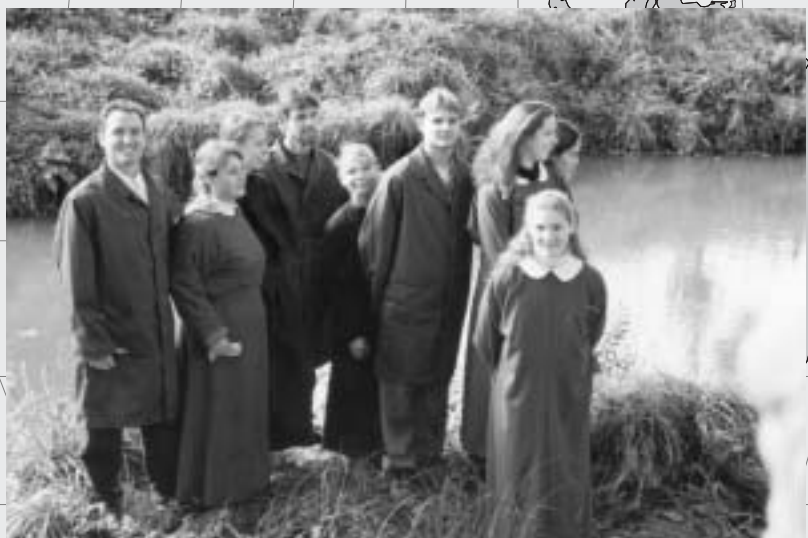
Baptism in New Zealand