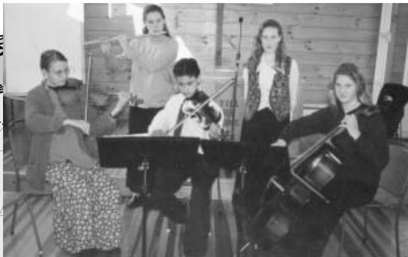
New Zealand strings