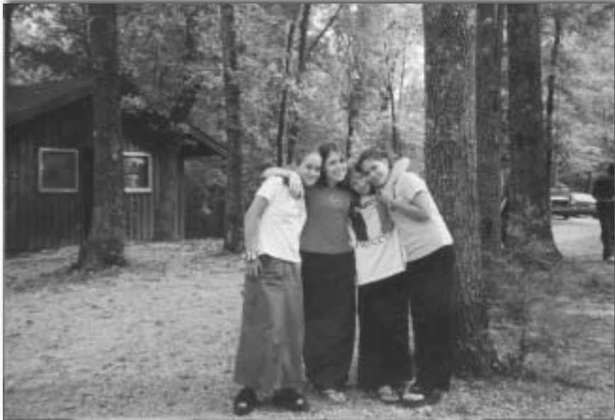
Warm friendships formed

Precious were the moments of our 1999 Bible Seminar. We spent four weeks together, yet it seems to have been but a twinkling of an eye. There was laughter, there were tears, bonds were formed, and lessons learned. However, most importantly, we were able to draw nearer, still nearer to our Lord and Saviour. We were able to partake of the Bread of Life, and learn of His divine nature. And finally, we were able to learn the correct methods of leading others to Christ, so that they may also experience the wonderful peace He has to offer. May the Lord bless each and every one of us in our daily walk with Him, and may we aid in the spreading of the gospel so that we may hasten His soon—yes, very soon—coming. Amen. 🌿