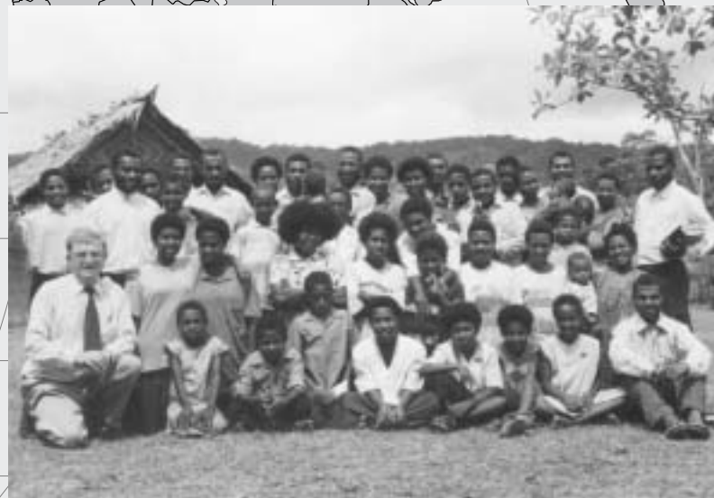
Some of our brethren in Papua New Guinea