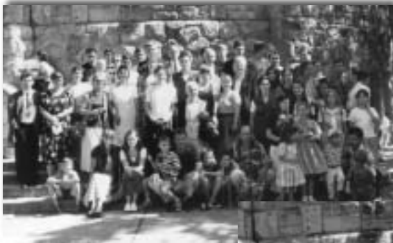
← Some of the people from Yugoslavia and Croatia