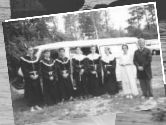
Baptism at Hungarian Youth Convention