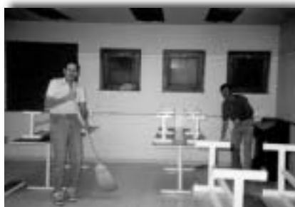
Hungarian ministers on kitchen clean-up duty