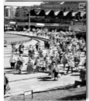
Emerging from the Budapest subway on one of the outings

As you can see, the meetings were full of spiritual meat. The days were spent in deep study. When you look at the topics you notice that deep