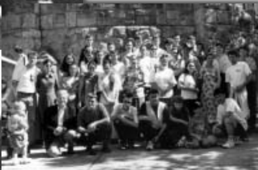
Some of the Romanians ↓