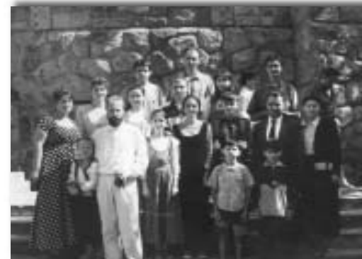
Some of the Moldavians

For those who were at the convention, do continue to study the topics introduced there. The time will come when you will have to explain