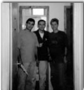
Preparing the grounds

the message of 1888 and the sanctuary message, as well as many other points of faith. Take the opportunity you have now to study them further.