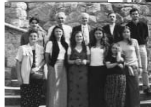
Some of the German attendees

The morning topics were presented by the writer. These included the sanctuary message (including Aaron's rod and the pot of manna), the counsel of the true witness found in Revelation 3:18, and extremism, a study about the differences between