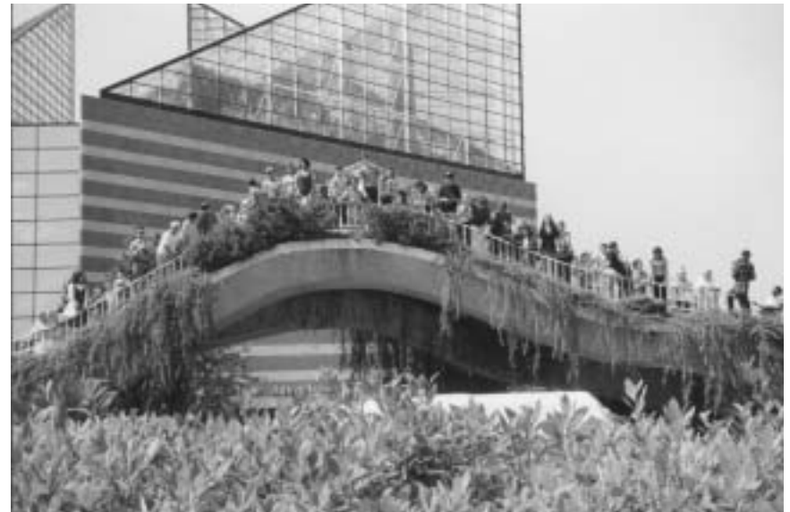
At the aquarium

F or those of you who did not come to the South East Youth Convention from July 11–18, 1999, in Harrison, Tennessee, USA, you really missed a blessing. We do not know about most Youth Messenger readers, but sometimes we as young people do not find sermons very interesting. At the Youth Convention though, it was different.