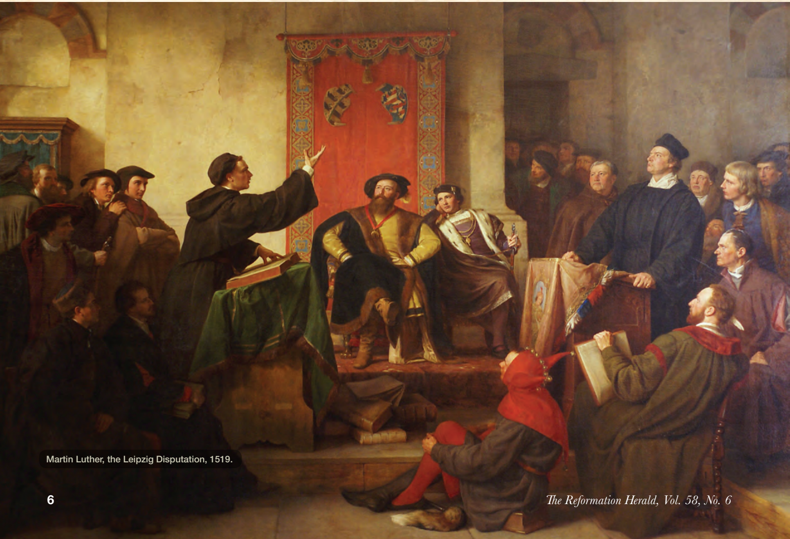
Martin Luther, the Leipzig Disputation, 1519.

There are many who claim that they have been sanctified to God, and yet when the great standard of righteousness is presented to them, they become greatly excited, and manifest a spirit which proves that they know nothing of what it means to be sanctified. They have not the mind of Christ; for those who are truly sanctified will reverence and obey the word of God as fast as it is opened to them, and they will express a strong desire to know what is truth on every point of doctrine. An exultant feeling is no evidence of sanctification. The assertion, "I am saved, I am saved," does not prove that the soul is saved or sanctified. Many who are greatly excited are told that they are sanctified, when they have no intelligent idea of what the term means; for they know not the Scriptures nor the power of God. They flatter themselves that they