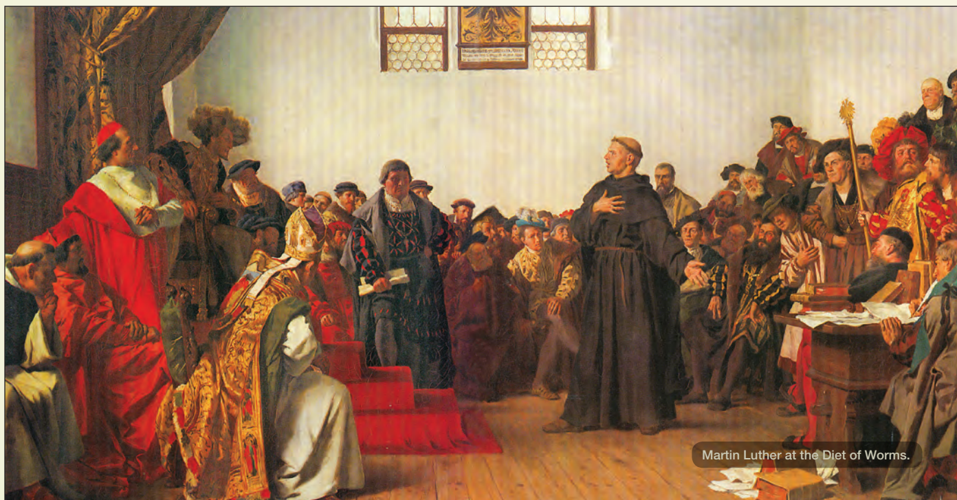
Martin Luther at the Diet of Worms.

“When he was again ushered into the presence of the Diet, his