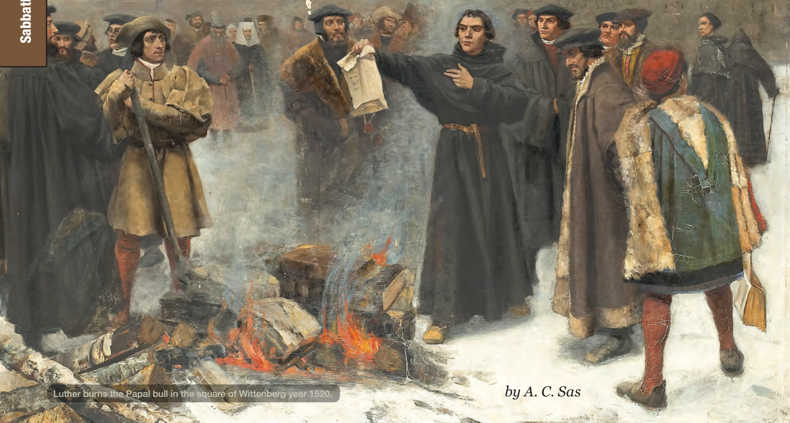
Luther burns the Papal bull in the square of Wittenberg year 1520.