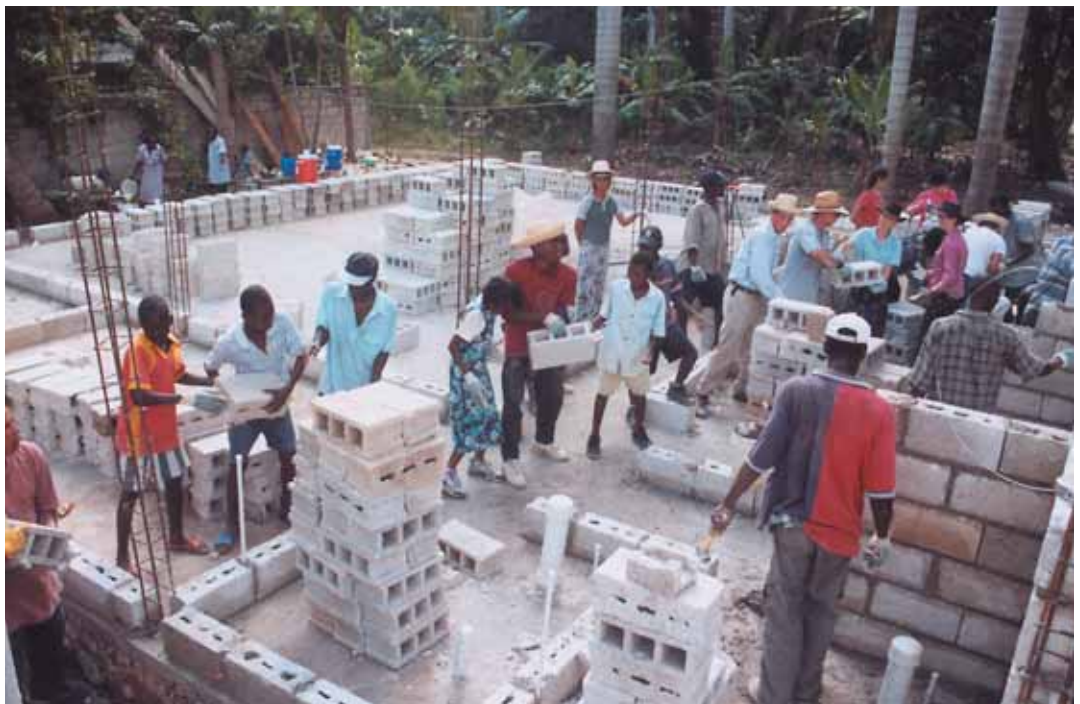
The Youth Building Program at work in 2002—constructing a chapel in Haiti.