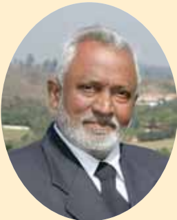
Soundrapandian Pitchmuthu India