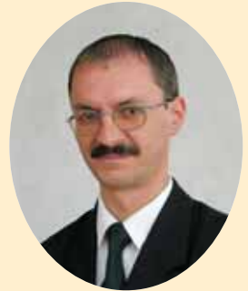
Ferenc Nagy Hungary