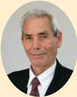
Caetano Verto Sink Brazil