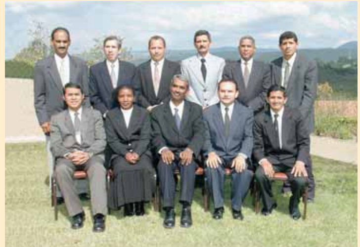
Central American Region