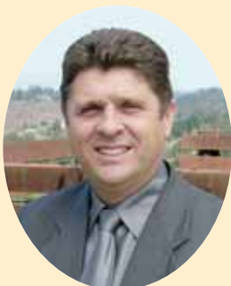
Petro Stratan Ukraine