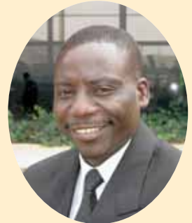
Isaac Daka Zambia