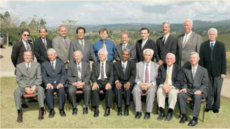
North American Region