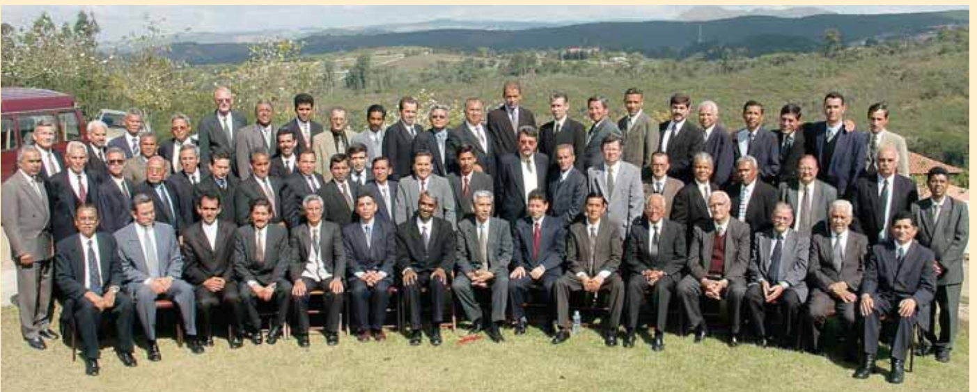
South American Region